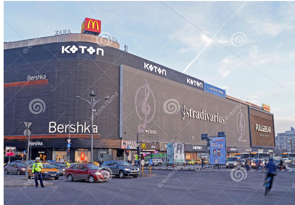
Unirea Shopping Centre

Download from Dreamstime.com This watermark comp image is for previewing purposes only.