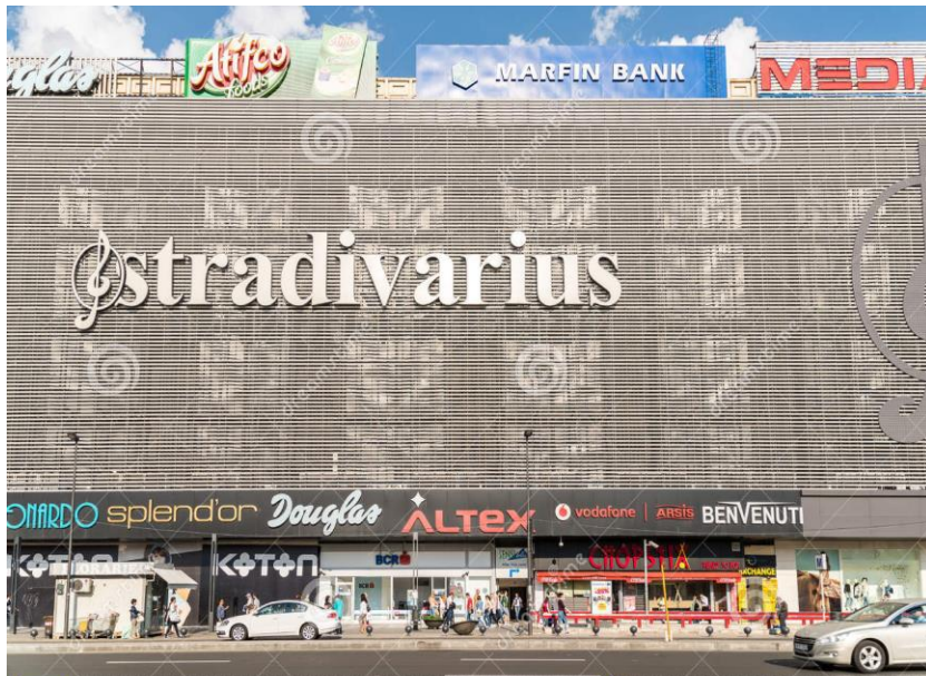
AFI Palace Cotroceni

Download from Dreamstime.com This watermark comp image is for previewing purposes only.